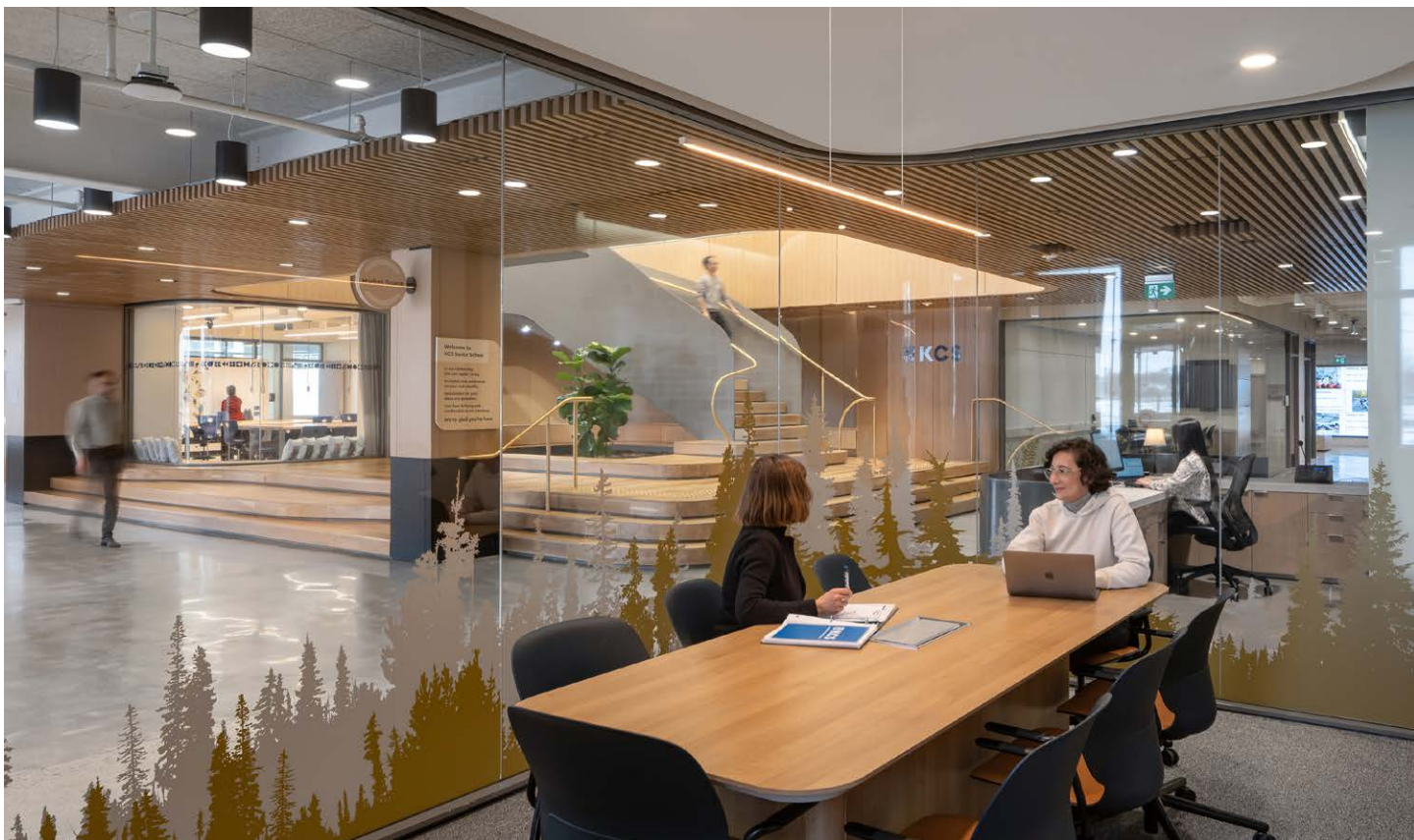
Above: Meeting Room with view to Market Place and Art Classroom

To further animate the entry space, views are provided into the Market Place (an ambiantly programmed social and event space), food kiosk, art studio, glazed meeting rooms, classrooms, breakout spaces, and views of the developing cityscape and Lake Ontario. The Market Place is the heart of the school where students, staff, and learning partners can meet, collaborate, enjoy lunch, present, perform, create, and even sell products from an entrepreneurial venture. The student-led café supports authentic experiential learning in entrepreneurship as part of the KCS Path Program which connects students to external experts and learning partners in the community.