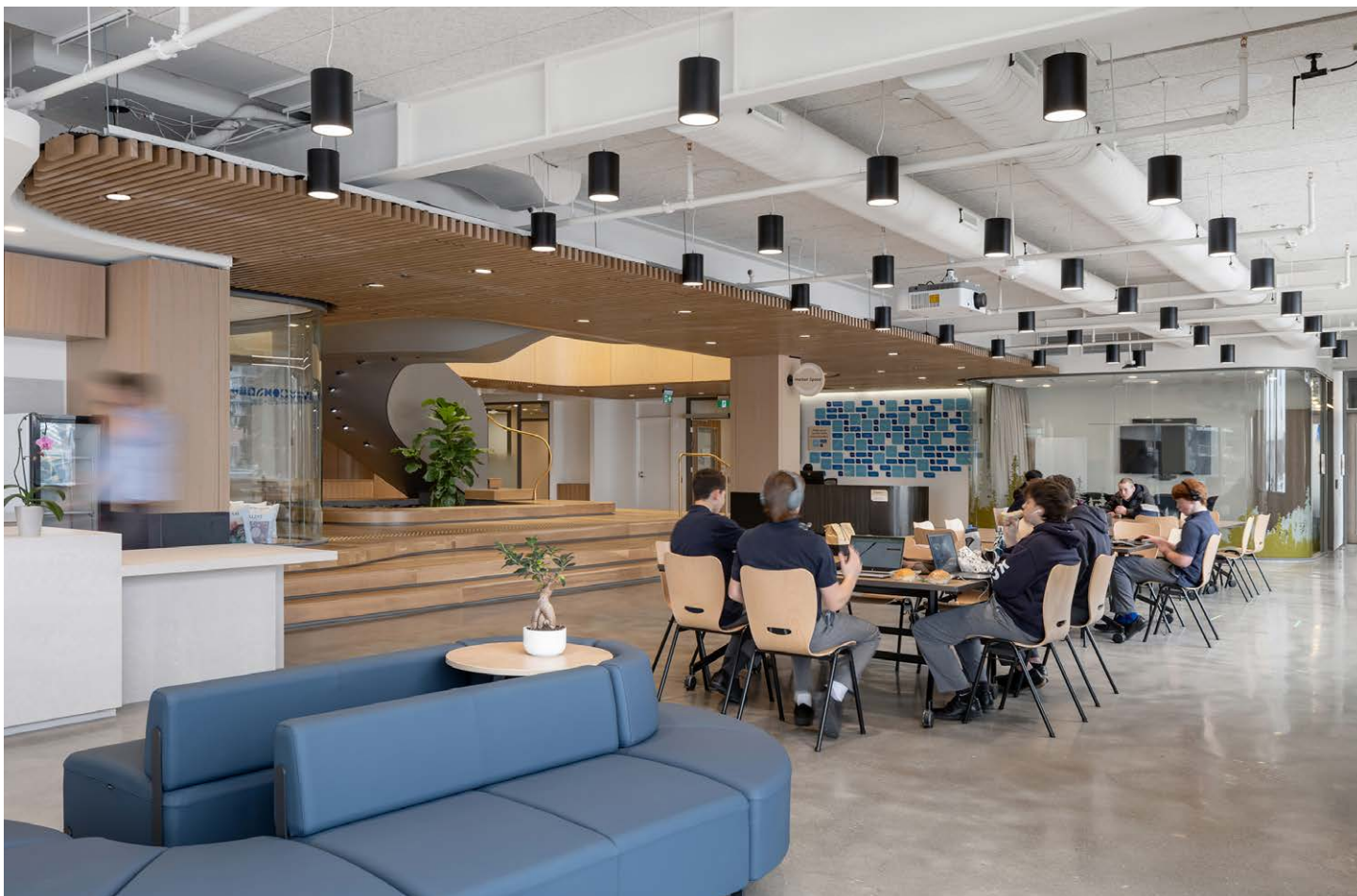
Above: The Market Place is the social hub and heart of KCS

Breaking with conventional school architecture, the flexible, open-ended design eschews the typical classroom arrangement and enables the learning environment to operate more like a series of flexible social and innovation spaces. In another break with convention, the senior school occupies 40,000 square feet of space on two levels of a 66-story condominium. While this model is not uncommon for schools in other dense urban environments (e.g., New York, Chicago, Hong Kong), it is still in its nascent stages in Toronto.